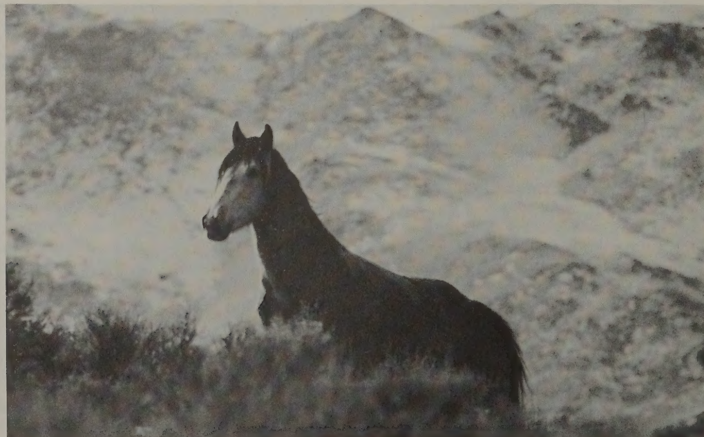
A wild horse stands sentinel in the Sand Hills north of Reno, Nevada.

If we in America feel a sentimental attachment to these obedient horses of fiction, film, and history, how much stronger is the attraction of the image of the wild free-roaming mustangs of the West! The myth and the reality of the frontier with its wide open spaces and indomitable, untamed spirit—these are powerful elements in the American character. As the Nation became increasingly urban, white collar, and desk-bound, the vision of majestic horse herds still running proud